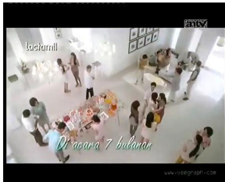
Figure 1. Iklan Susu Lactamil