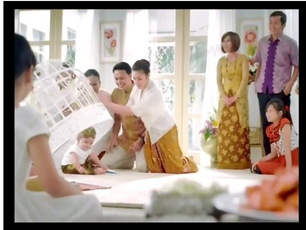
Figure 2. Iklan SUN