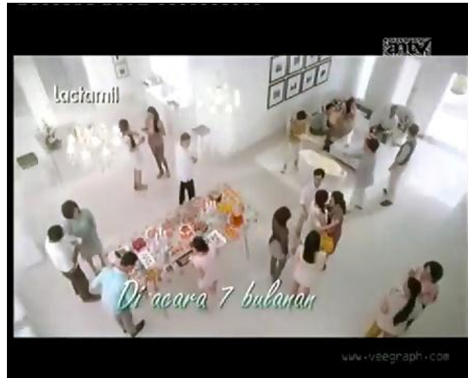
Figure 1. Iklan Susu Lactamil