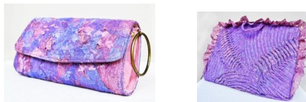
Figure 2. Research of Utilizing Brocade Fabric Arumsari (2010)

Textile leftover that is gained from production process at TPT (Tekstil dan Produk Tekstil) Industry comes in various types, of which one of them is brocade. This is a type of fabric that is easy to get at various clothing production places. Brocade is used to make many kebayas and party gowns. Indonesian women usually have kebaya to be worn for different purposes. For instance wedding ceremony, traditional ceremony, party, school or college graduation and other occasions that make this type of fabric usage level is very high. Research of utilizing brocade fabric has previously been conducted by Arumsari (2010). Processing method used was “recycle”, with various techniques such as: sewing, plaiting, heating and tufting.