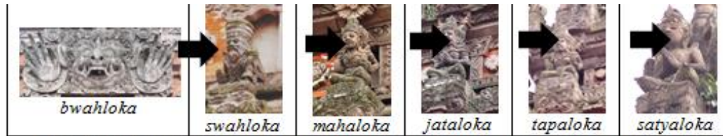
Figure 02: the events of man's spiritual journey (reading from the bottom to the top of the building)