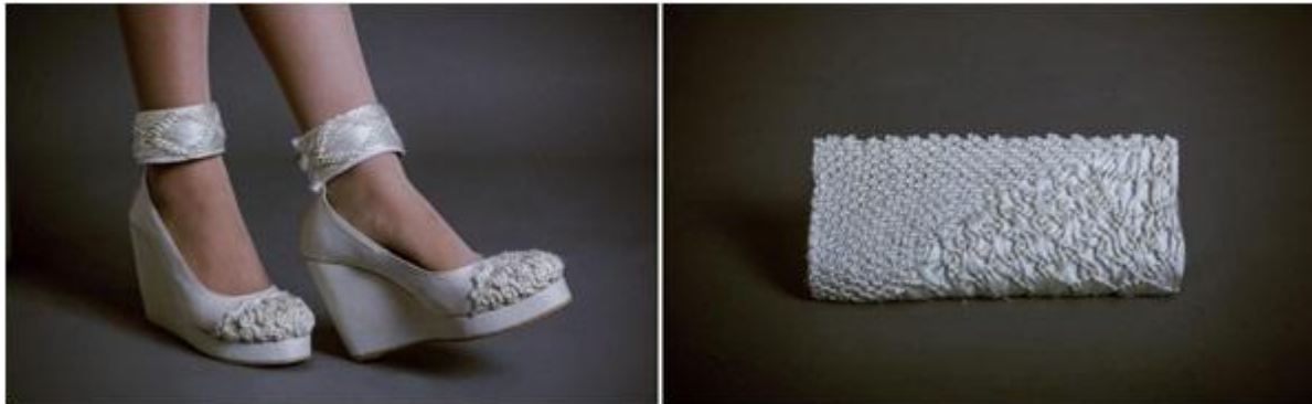
Figure 10. Shoes and bag (Hady, 2012)