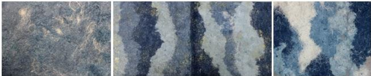
Figure 4. Utilizing weaving waste using press and Indigofera dye (Riska, 2013)

Textile production using the press technique using weaving waste is very simple, namely by clamping and pressing the threads to form pieces of cloth. The threads cling to each other, thus forming a unique surface texture and character. Colouring is done using natural dyes from indigofera tinctoria to create varying shades of blue.