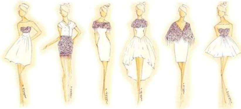
Figure 7. Sketches of dresses using silk weaving waste and macramé (Hady, 2012)

The products made are textile and fashion products. The textile product is in the form of cloth measuring 35 cm by 100 to 150 cm and fashion products are in the form of dresses and accessories in the form of bags and shoes.