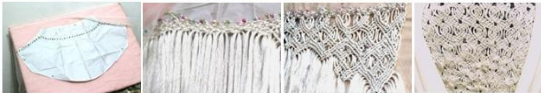
Figure 8. Silk weaving using macramé (Hady, 2012)

Following numerous design processes, the products made are cloths, dresses, bags, and shoes.