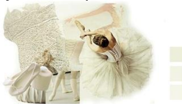
Figure 5. Alluring Ballerina (Hady, 2012)

The creative process study is used to produce the desired a textile or fashion product in accordance with its theme, concept, product, and function. Special materials and techniques require special concepts to fashion a product. Silk weaving waste is very delicate yet has varying qualities which requires meticulous attention to detail when using elaborate macramé techniques. Both aspects lay the foundation of the concept to be used. Enchanting Ivory is chosen as the general concept, with special attention given to the captivating quality of the colour of ivory. The theme is La Ballerine – the ballerina. The theme is proposed to invoke femininity, grace, and elegance of a ballerina. The La Ballerine concept is deemed suitable to create ivory white dresses made of fine silk threads using the macramé technique.