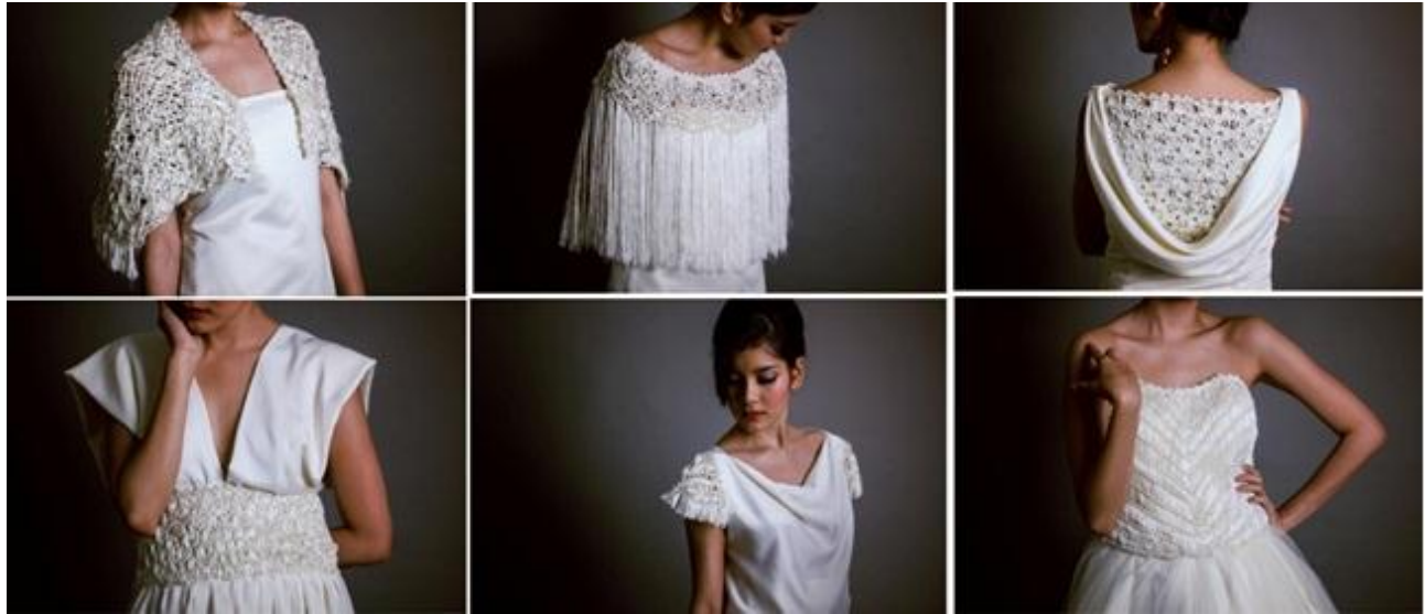
Figure 9. Dresses (Hady, 2012)