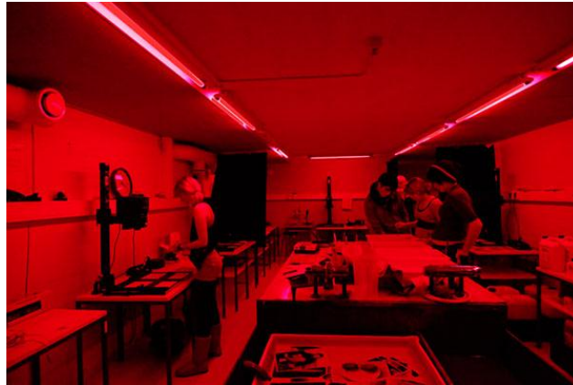
Figure 2. Dark Room for Photography

( http://rlxphotography.files.wordpress.com/2012/03/in_darkroom_4-2-2010- photo_by_hannu_sinisalo- www-600.jpg )