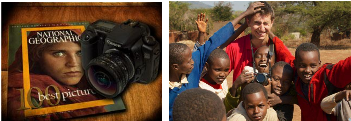
Figure 6. National Geographic Magazine works, National Geography Photographer http://raisedonhoecakes.com/ROH/wp-content/uploads/2012/10/Nat-Geo-Photo-Contest-ROH.jpg , http://ww2.hdnux.com/photos/17/62/34/4138813/5/628x471.jpg )

Nowadays there is no denying that photography is an authentic document against an event that occurs in this world. Photography can bring the atmosphere of the past events in the present atmosphere. And photography can tell more than words and can evoke a buried memory. The debate about the identity of the photography appears when the digital era was born, a problem that became a summit debate was none other than the authenticity of a work of the photo. Where on the work of a standardization of digital photos from the authentic value is not too important, rather than the use of photos at this time is very widespread for this modern community life, which is characterized by a political and business in it.