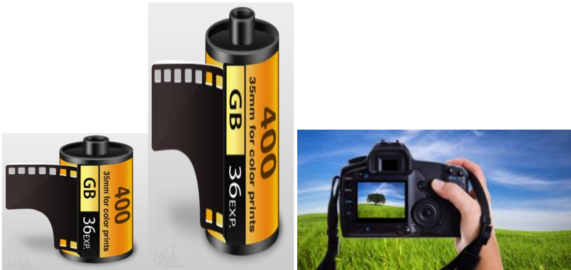
Figure 1. Roll film used in cameras in the past, DSLR Camera with an LCD screen for photographers

Along with the changing times, the discovery of a new medium in the world of photography: digital photography, creates a long debate about the definition of a photographic work. The problems resulted in that other parties declare that photography is unique, as well as citing the term P. Bourdieu that States that photography never lies, and do not change nature; While on the other hand they stated that with the advancement of digital technology, photography became the human tool in developing dimaginal work. Therefore with the discovery of new facts, then a new redefinition of paradox is needed in photography.