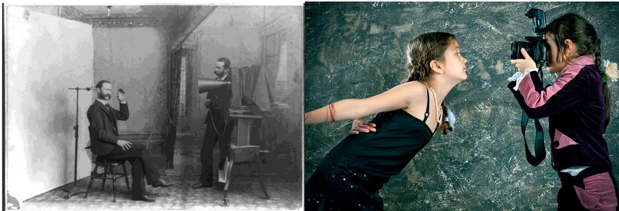
Figure 5. Old Photographer 1893, Today's Photographer

Nowadays, we are in a period of psychosocial change in digital culture which contains things to be aware of like enchantment and madness toward image and impression of the surface, which are often shallow and unwarranted. The odd hysteria against fictitious charm is strange enchantment on power and artificial intelligence (electronics), as well as just the adrenaline pumping without satisfaction and meaning. The party at any time is without celebrating anything. The Interesting thing in the current era of digital photography is that there are difficulties to claim a truth or a system with a single specific value, since the value of meaning is relative and is wrapped by the interests of some parties.