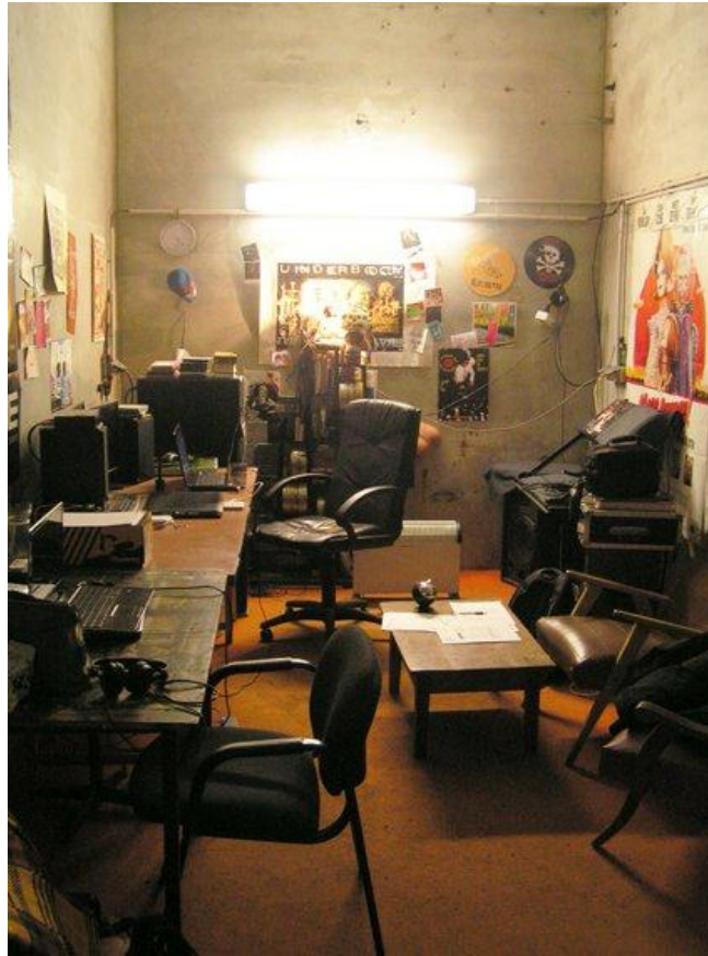
Figure 3. Light Room or Editing Room for Digital Photography