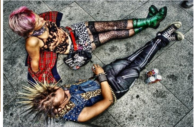
Figure 4. Old Photographs 1840-1929, Today's Photography

( http://www.familychronicle.com/images/photoharwood.gif , http://www.ilex-press.com/wp-content/uploads/making_a_statement_b.jpg )