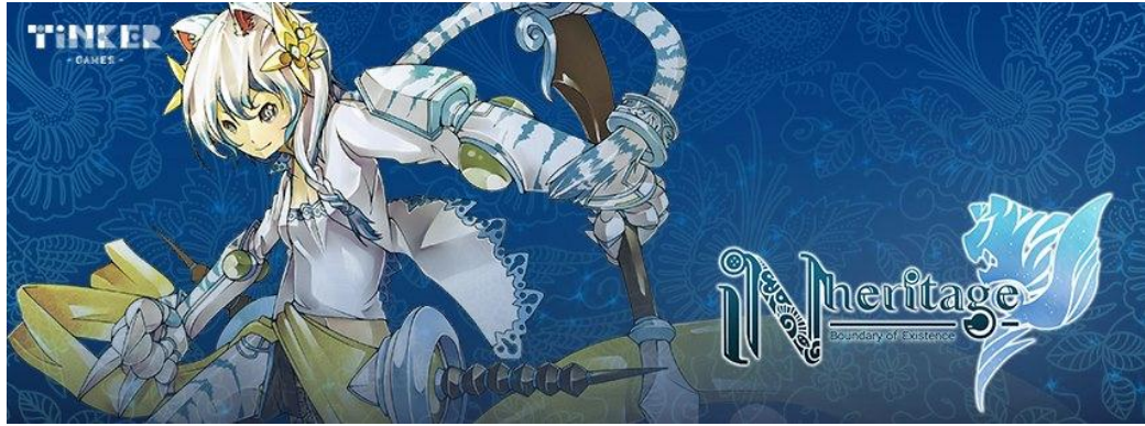
Figure 1: Banner of INheritance : Boundary of Existence