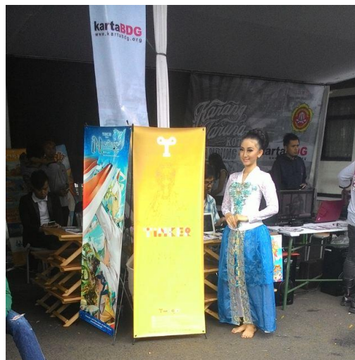
Figure 4: using traditional clothes batik Patrakomala Cangkurileung that same with Nala in the game INheritance: BoE to promote the game

It deals with what will be discussed by the speaker. A good topic is a topic that is simple, easy to carry (portable), and natural. The entire WOM indeed originated from an exciting topic to be discussed. From interviews that investigators obtained, the average of the topics discussed and that occurs between players and prospective customers is the culture, the depiction of the characters and themes of the unique and interesting story to follow. Various news portal that addresses INheritance was almost all topics discussed and having a focus on culture, and the original game made in Indonesia. The conclusion of the discussion, which became Topics in five basic elements in the formulation of WOM is about the culture, the originality of the story and the portrayal of characters and the interface of game which is unique and interesting.