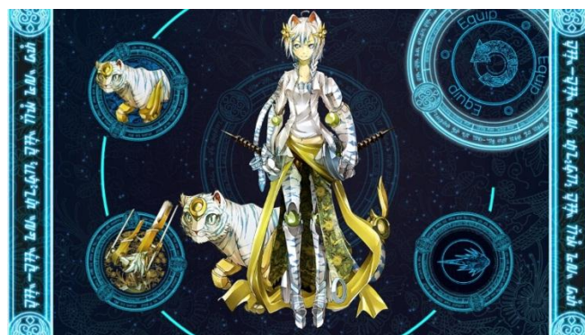
Figure 5: example of cultural elements in the INheritance BoE