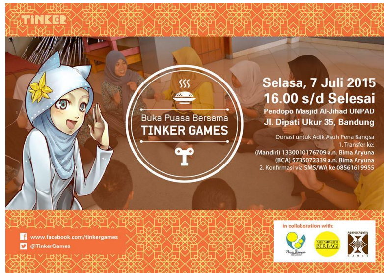
Figure 6: example of brochure that Tinker Games use

Tool deployment of the topic by the speaker. Topics that have been there also need a tool that helps to keep the topic or message can be run, the tool is a tool that can make people easily discuss or transmit the company's products or services to others. Could be with a sample, coupon or brochure. Or the Internet is also a very effective and helps to keep the message be able dispersed. It is mainly through mailing lists, or other social media. According to the results of interviews have been conducted, the tools used to spread WOM and used by consumers to invite friends to play the game is almost all through social media such as twitter, facebook. Even deviantart as an illustrator site used to display and sell the works of an image is also used to promote the game INheritance BoE. Researchers conclude based on interviews and observations, that the use of various of social media to reach out to all players INheritance and promote it through various media and events performed very effective.