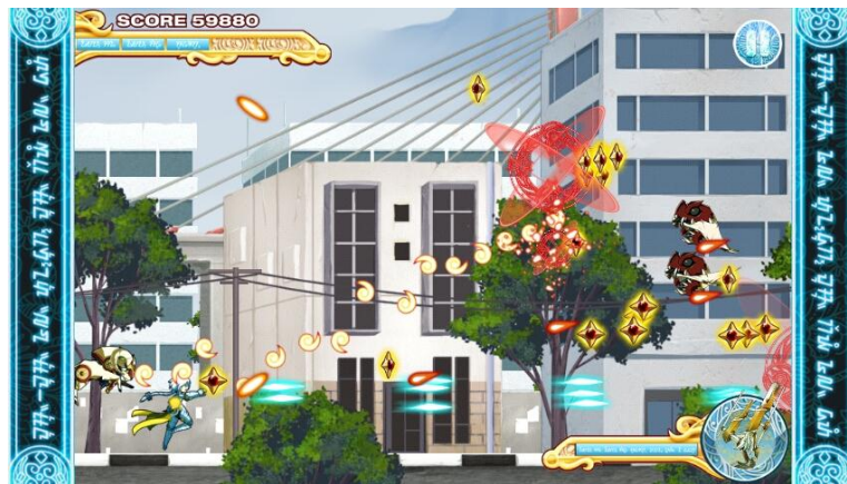
Figure 2: game INheritance : Boundary of Existence on device android