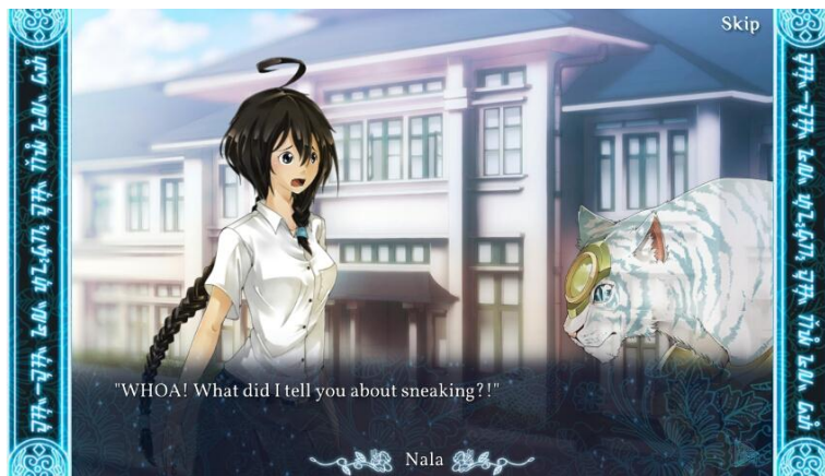
Figure 3: game INheritance : Boundary of Existence on device android