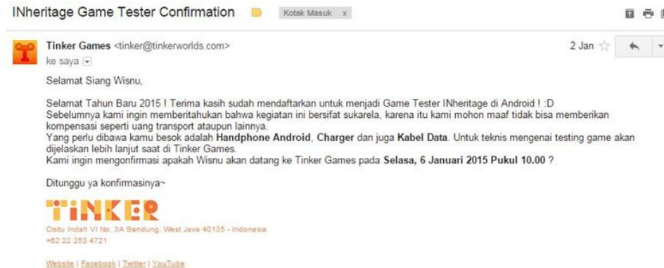
Figure 8: promotion mail through gmail to invite player to become beta tester the game

the news and images disseminated via deviantart site that has an international base. In this way, many connoisseurs images or games from abroad and within the country know about the news. To include a link to visit the official page and the teaser of INheritance itself, the visitors page Deviantart this new information. From this information can be open discussion of the topic of the visitors who become WOM later.