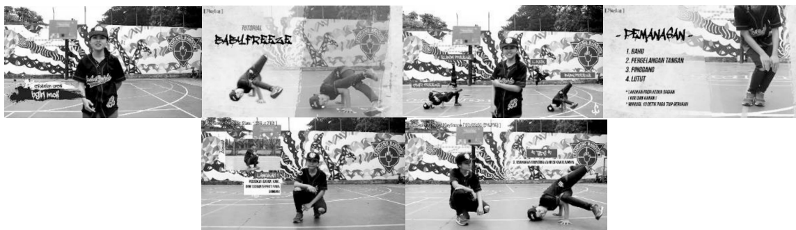
Figure 6 Breakdance Basic Tutorial: Part 3 | Freeze Category | Babyfreeze