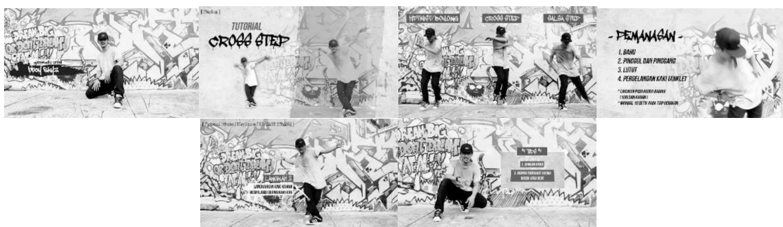
Figure 4 Breakdance Basic Tutorial : Part1-Toprock Category-Cross-Step