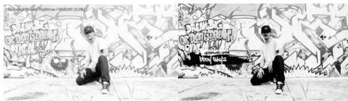
Figure 3 Colour Grading on the result of design

The colors on the video plays an important role in the creation of the impression of the video itself. Colour grading is also used by the authors to avoid the impression of color flat or flat. The author uses the software Adobe RGB scale PremierePro highlight CC to color balance and contrast of the video that will be designed to form a fresh color characters (fresh) with the impression of youthful and vibrant.