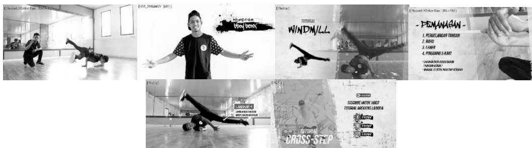
Figure 7 Breakdance Basic Tutorial: Part 4 | Powermove Category | Windmill

In this section, the author can outline the finding by discussing the relationship between the finding of research conducted and the results of previous research, the implications of the research results (impact of science) and show the limitations of the study, and suggestions for future research.