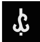
Figure 1 Stickyway Logo

Media that used as the primary medium in this design process was video. As for the distribution of media design results is a Youtube video of this guide. Youtube is one website video service providers open space that can be accessed by the entire community for free. The author will make a special channel for video guide about basic break dance movements in Indonesian language on Youtube. The channel will be named "Stickyway". Stickyway is a slang term or in hiphop, which means the track itself. That is, Stickyway is a channel on Youtube are on video breaking guide to dance with different visual content of video guides breaking dance in general, thus creating its own market lines. This Stickyway will have a variety of video content in the breakdance movements guide and videos that contain breakdance elements therein. Logo Stickyway designed to incorporate a combination of the letters "S" and "W" (initials Stickyway) and form a b-boy who was doing the breakdance. Hopefully, through Youtube, a video guide to the basic breakdance movements that make in Indonesian language can be easily accessed by the target audience.