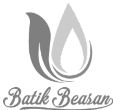
Figure 2 Batik Beasan Logo

The logo shape takes the form of a basic yellow paddy that ready to be harvested. This good shape of paddy will produce a fluffier rice, this shape also represent classic proverb which the meaning is