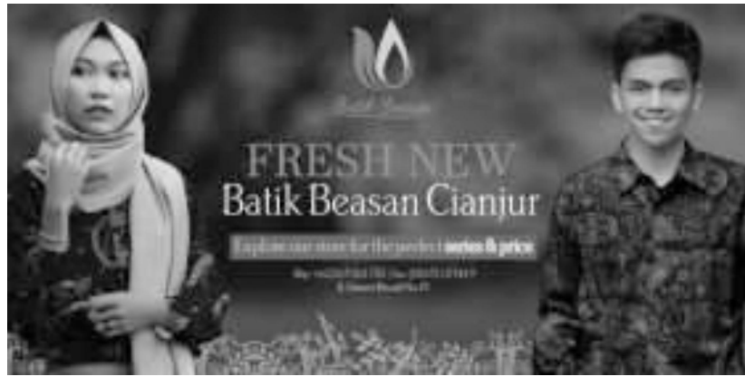
Figure 4 Horizontal banner to inform and persuade