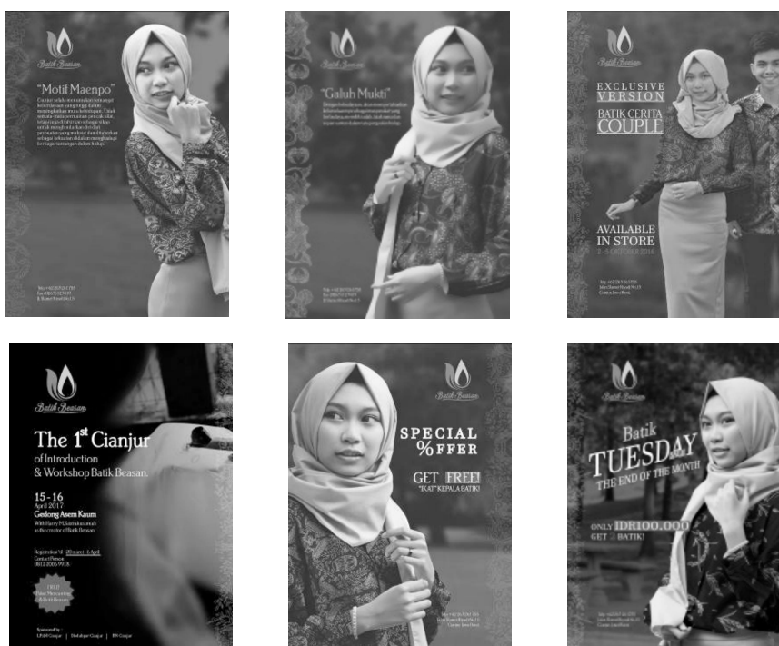
Figure 3 Poster to inform and persuade

The result of promotional media design such as posters and horizontal banner are as follows,