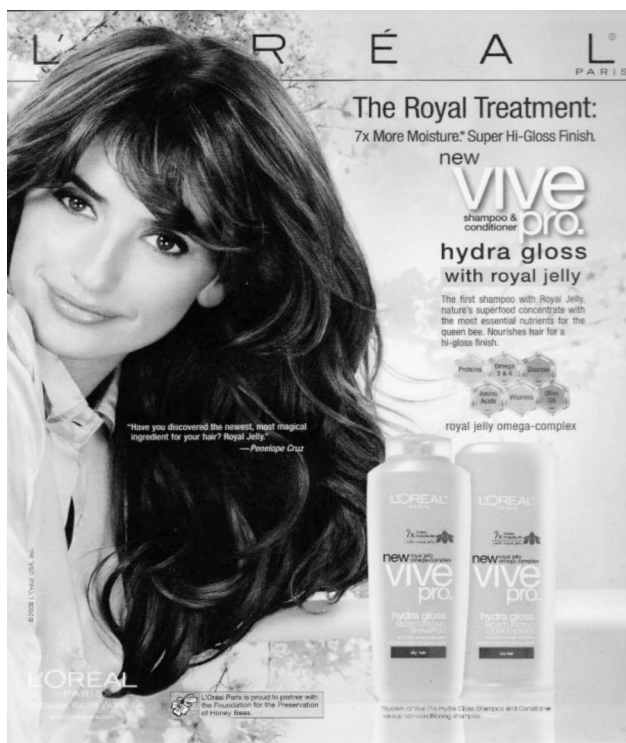
Figure 2. Print ad of VIVE Shampoo

The order of subject and finite in this mood type is finite followed by subject (for polar interrogative), in addition just add wh-, for wh-question. The finding is bellow: