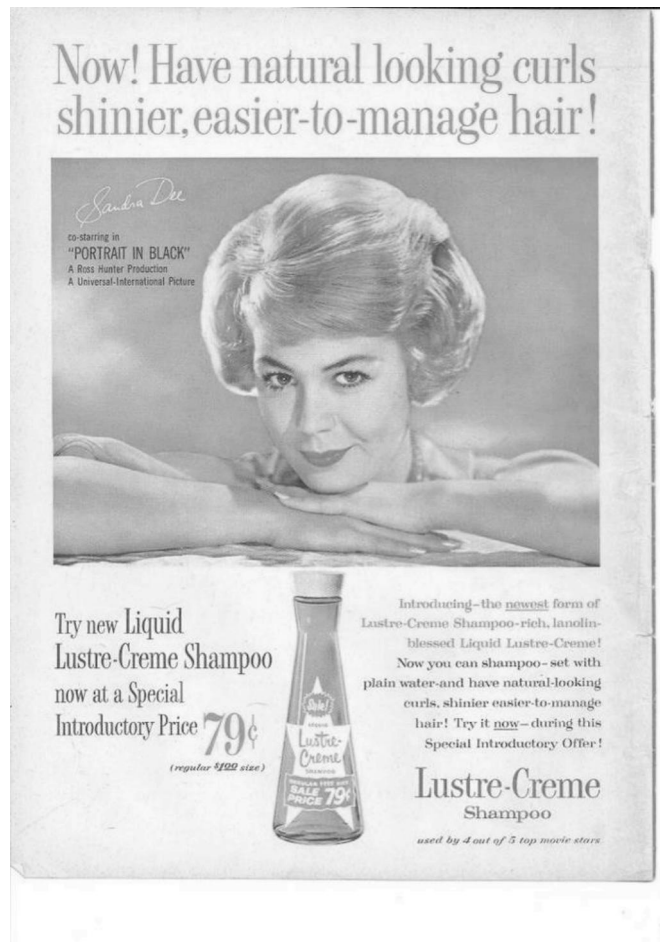
Figure 1. Print ad of Lustre-Crème Shampoo.

According to the theory, the order of subject and finite is indicating types of mood. In declarative mood the order of finite and subject is subject followed by finite. The data note that the declarative mood has 97 items from 124 items. The declarative mood is as bellow: