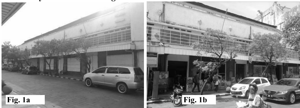
Figure 1a and 1b. the façade of Sumber Hidangan, Bandung.

Orderly rhythmical streamline on the façade before (left) and during (right) operational hours.