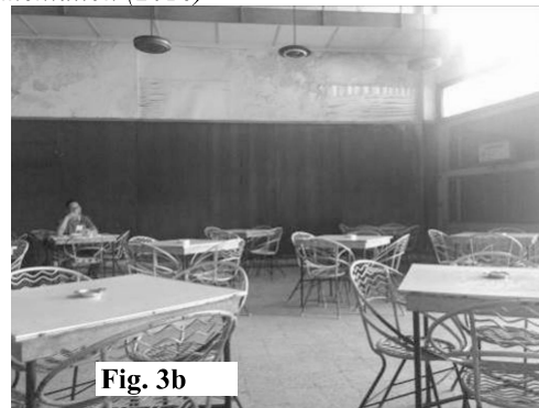
Figure 3a and 3b historical atmosphere created by the style of the Dutch Colonization architecture.