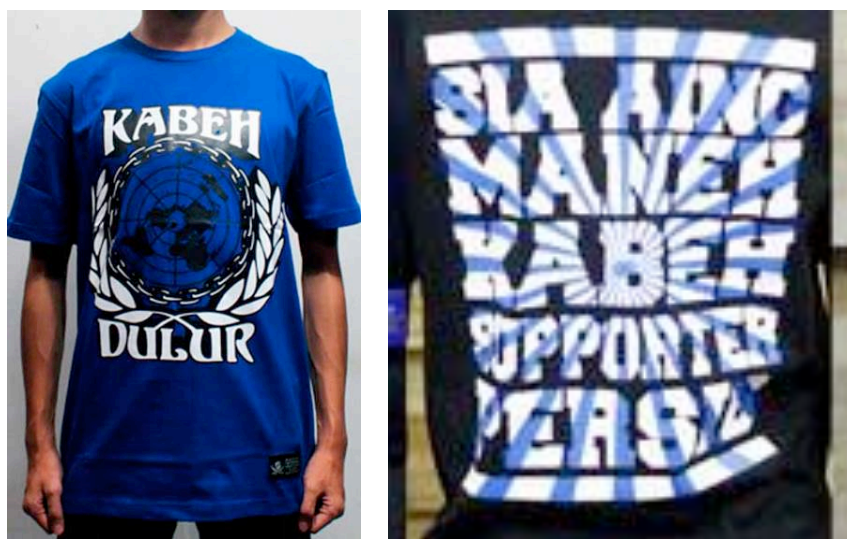
Figure 1 a Sundanese in a PERSIB supporters T-shirt

In the t-shirt worn by the supporters PERSIB, Sundanese language as the language of the West Java area is often used as copywriting in the design of the t-shirt. Usually the Sundanese language expressions contained in t-shirt voiced about the love of PERSIB or contain a call to support PERSIB.