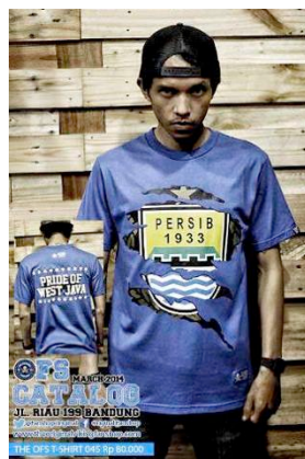
Figure 3 PERSIB logo on supporters t-shirt design

In a study of visual communication design, logo is an identity that represents an institution. As a football club, PERSIB have a logo that presented either in jersey or on other applications. By the fans, logo PERSIB often placed on media aimed at showing its support to PERSIB.