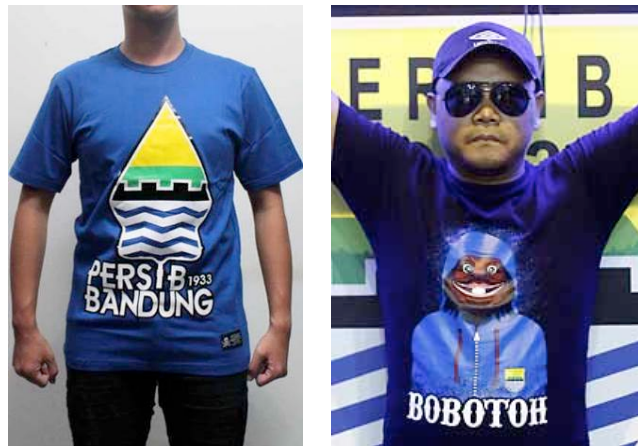
Figure 2 Wayang golek elements in design of PERSIB supporters t-shirt

Apart from the language, the elements of regionalism is also seen in the use of more diverse cultures, one of which is a wayang golek show. Wayang golek show in West Java is very close to the people, Cepot figures contained in the wayang golek often present and became an icon of West Java. In addition, wayang golek show is an art that is often performed both in rural and urban environments.