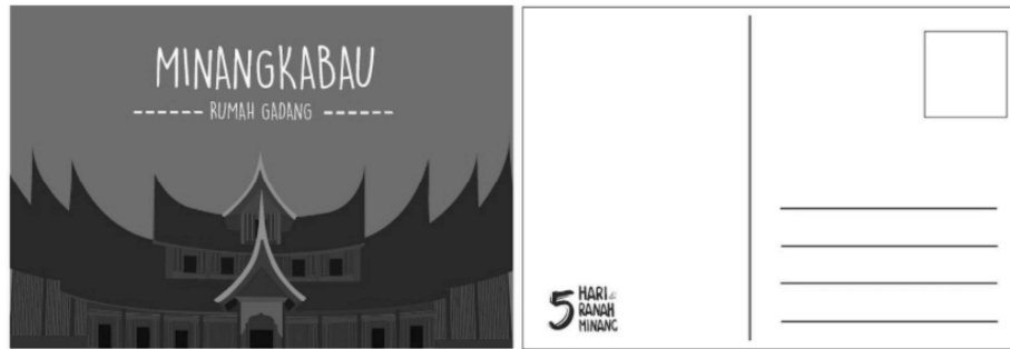
Figure 3 Postcard