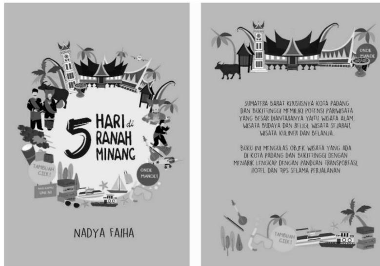
Figure 1 Cover