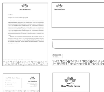
Figure 2 stationery