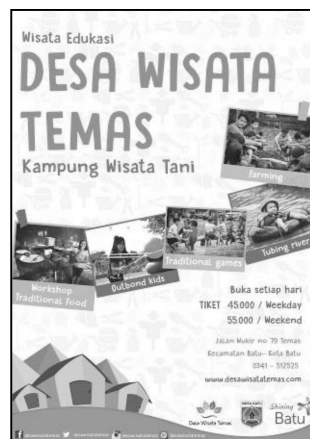
figure 4 poster