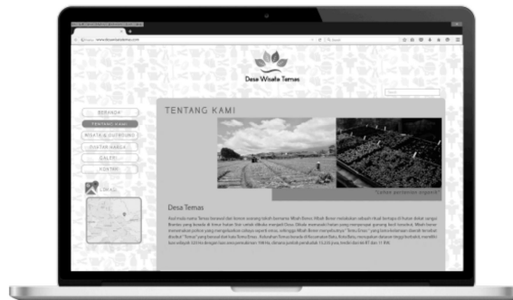
Figure 6 website