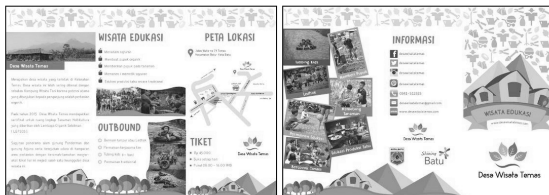
Figure 5 brochure