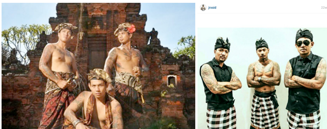
Figure 3. #ProudBalinese

One of the taglines, especially on social media, is 'Proud Balinese' or on social media is written as #proudbalinese. Through idealism and follower have been gathered, he moves the mass, specifically youths of Bali, to support Bali Against Reclamation movement.