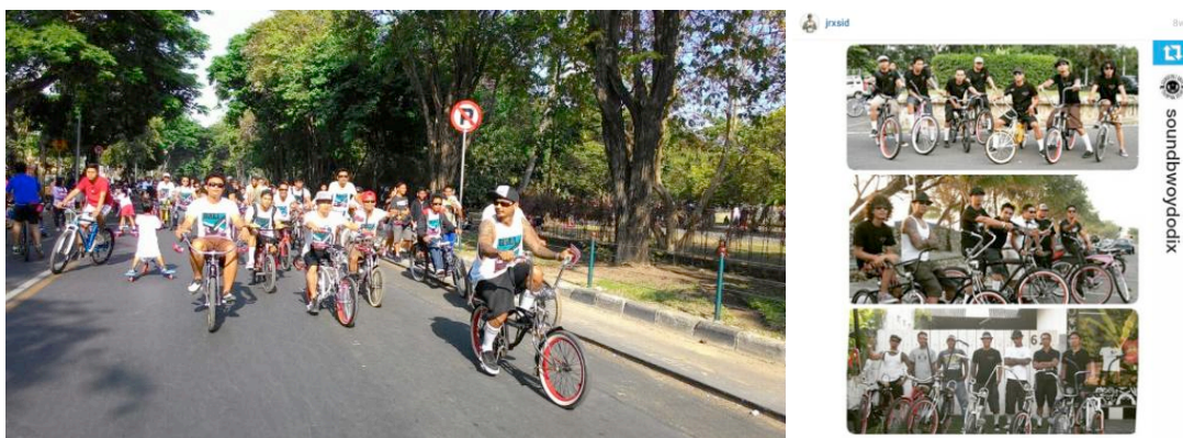
Figure 5. Low Rider Bicycling Hobby