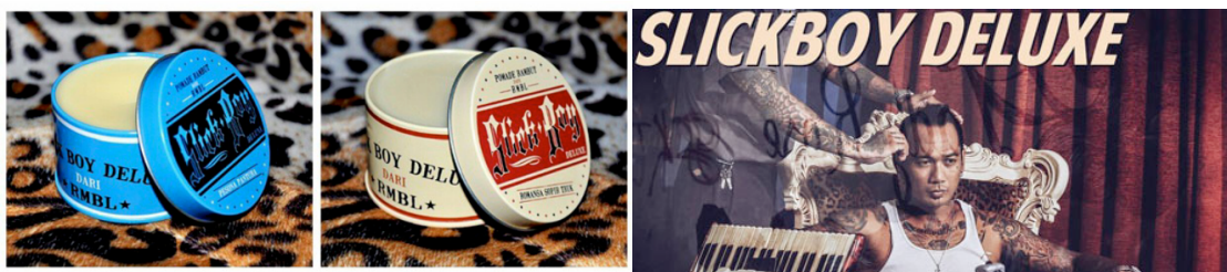
Figure 6. Hair Style