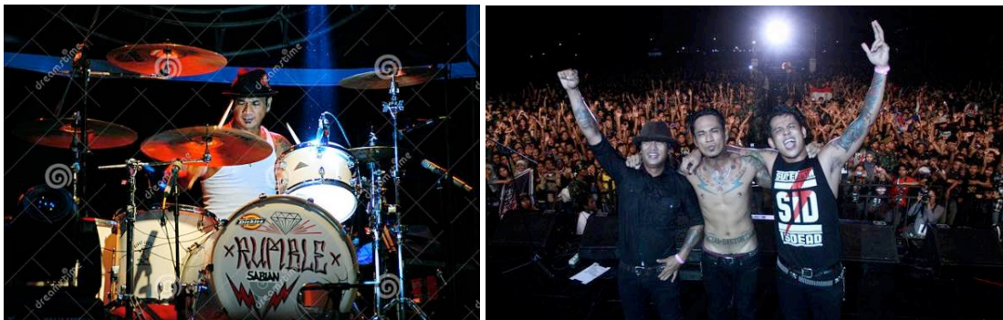
Figure 1 I Gede Ari Astina as a member of Superman Is Dead

This paper will discuss subjectivity on pictures of Jerinx (I Gede Ari Astina) and RMBL Clothing on Social Media. I Gede Ari Astina or as known as Jerinx is a drummer and song writer of a band named Superman Is Dead, a popular punk rock band from Bali. Although Superman Is Dead is not a band with a specific type of music and also not a type of common pop music, this band is accountable in Indonesian music which is proven through its achievement as the Best Band in Anugerah Musik Indonesia (AMI) 2014 . In addition, Superman Is Dead has many and loyal fans base named Outsider and Lady Rose. In addition to his music career, I Gede Ari Astina also owns a clothing business named 'Rumble Clothing'.