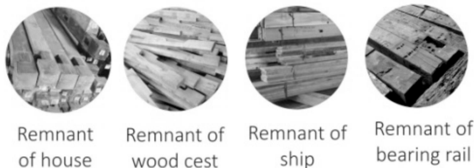
Figure 2 the types of remnant wood

It is believed that the resilience of wood chest last up to 5 years, so that it coincides with the periodic changes made by the hotel and cafe to make design improvement in accordance with the trend development. Former timber railway sleepers have become one of the alternatives for using good quality wood. Wood that has been used as a cushion rail is ulin wood or commonly mentioned as kayu besi in Indonesia (iron wood). Ulin is a native plant from Sumatra and Borneo, Indonesia, which are included in the category of world protected trade timber (Hidayat.S., 2003). Ulin wood has high quality, resistant to different weather or nature conditions and able to face the invading organism attacks wood (Gusmawalati.D., et.al., 2014).