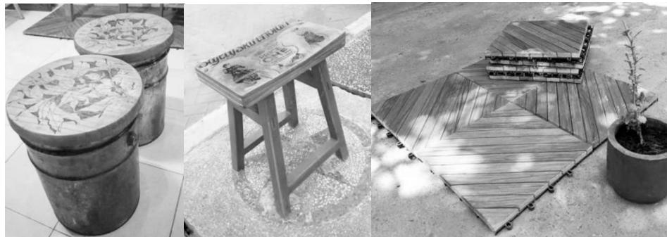
Figure 5 products from industry 2

In 2010, Indonesia has a population of 237.6 million people (Central Bureau of Statistics), with a predominance of productive age of 15-55 years by 60%. Meanwhile, Indonesia experienced a growth of 1.3 percent annually. It is estimated that in 2034 Indonesia will have a population of 303.9 million people (projections Central Bureau of Statistics). It is the fact that illustrates a very large market opportunity in the country. Besides having the export markets, it is important for the furniture industry to dominate the domestic market. In addition to population number, the opportunity for the furniture industry also emerged restaurants, hotels, up to the office. Thus, the furniture export market orientation can slowly shift to enter the domestic market. Industry 2 specifically focused on using remnant wood and the modification of old furniture. Therefore, most of the design from industry 2 can not be reproduced because the material is limited. The unique design and limited precisely attract local consumers.