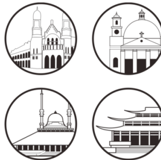
Figure 3: Four most recognized buildings identified by more than 75% respondents

The next step is redrawing the 10th most recognized building by its facade appearance as line-drawing colourless. The line-drawing pictures went to be second part testing form. Again, the same number of respondent taken randomly and showed the second part testing form. The result showed there are 4 building recognized by more than 75% respondents. They are, Lawang Sewu Building (97,47%), Provincial Great Mosque/ Masjid Agung Jawa Tengah (92,41%), Domed Church/ Gereja Blenduk (84,81%) and Sam Po Kong Temple (77,22%).