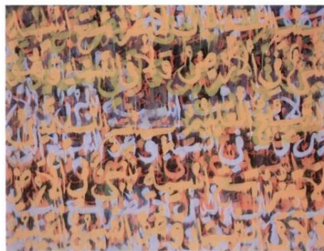
Figure 3 calligraphy scene by Agus Bakul