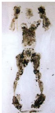
Figure 4 by Tisna Sanjaya entitled “tubuh 5 waktu”