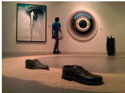
Figure 2 the work of Islamic Arts entitled Last Journey by Gabriel

The diversity of thought and interpretation coupled with the globalization, gave extraordinary diversity that resulted in a distinct form of visual works in Islamic art. Diversity could be seen from the themes depicted or expressed in the works, such as calligraphy, abstract, geometric, stylized, flat, theme of humanity, nature, personal, and others.