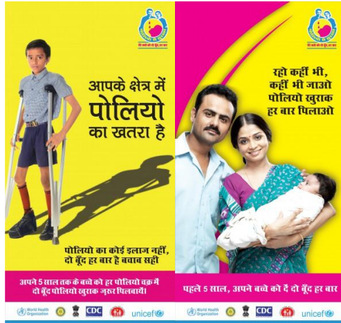
Figure 3 the poster states that there is only two drops every time will save you from the polio (left); the posters designed for emotional appeal to the parents