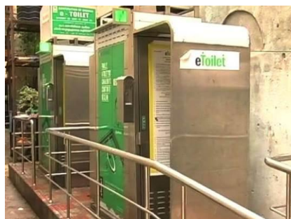
Figure 9 the e toilets are built as a part of Clean India Campaign