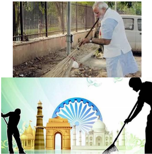
Figure 7 Indian Prime minister Mr. Narendra Modi working for the clean India campaign