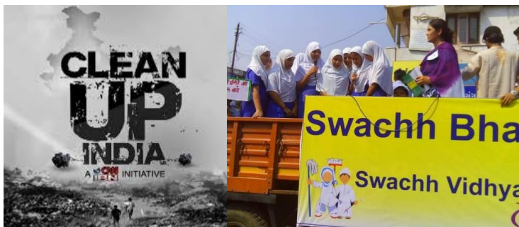
Figure 8 promotion of the clean India Campaign through Television Chanel CNN IBN (left); participation of Students in the Clean India Campaign rally