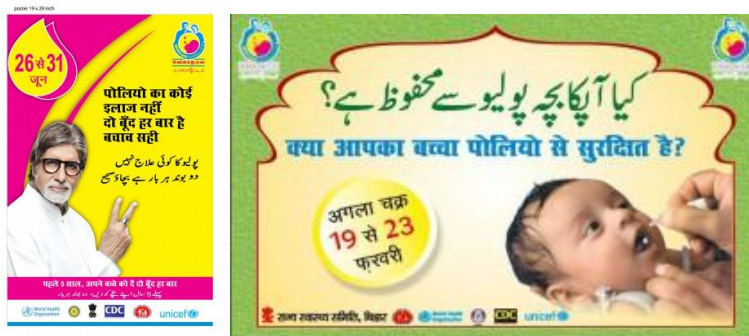
Figure 2 Amitabh Bacchant the brand Ambassador of the campaign appealing through the poster those only two drops of every time would help to cure Polio (left); the second appeal by showing the picture of a baby and the question copy asking about the safety of the child. "Is your baby safe from the Polio?"

With the financial and all support of government agencies, the polio eradication campaign is proved to be one of the successful campaigns carried out by the government of India with the support of world health organization, UNICEF. But this would have not been successful without the visual appeal. The advertising campaign carried out with role models brand ambassadors and emotional factors through various visual medias.