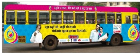
Figure 4 promotion of Polio eradication campaign through buses

Rotary ‘this close’ campaign, indicating that polio is just going to end