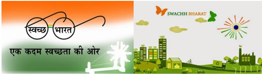
Figure 6 symbol: Clean India Campaign (left); Hoarding Design for Clean India campaign