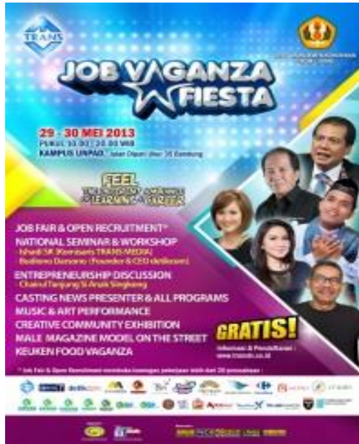
Picture 3: Joint-Event Fikom Unpad with Trans Corporation