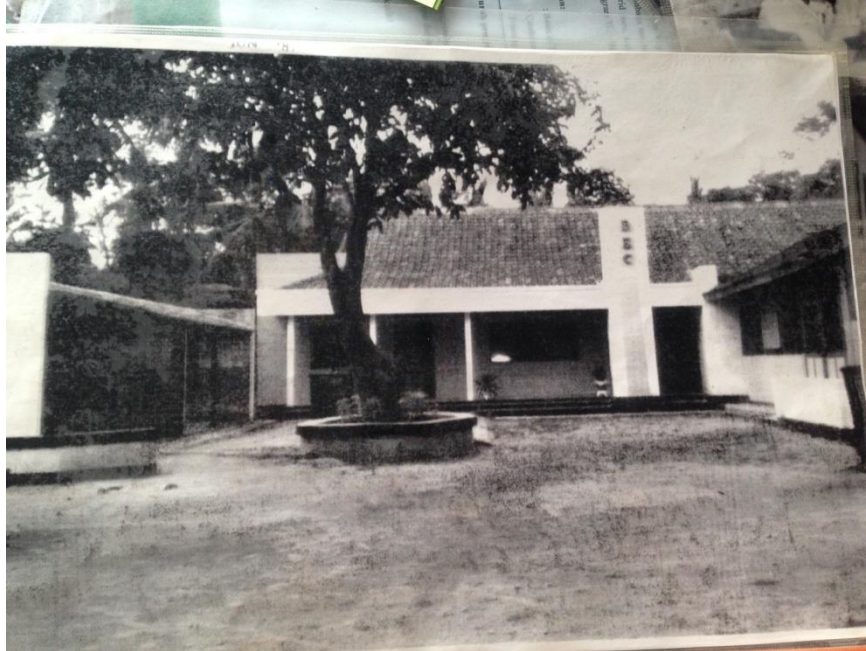
Picture 4. Basic English Course in 1980