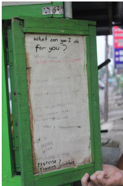
Picture 9. Picture of English Words in Toto's Cart windows