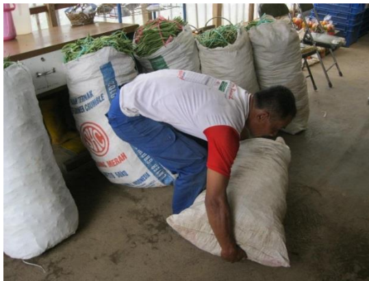
Figure I.1 Operators Taking Sack Bean

The observation of the posture of the operator also showed the presence of non-ergonomic working posture when operators perform the manual material handling process. Figure I.1 showed operator bent to pick up a plastic bag. It is one of non-ergonomic working postures that is back and chest thrust forward over an angle \geq 20^{\circ} to the vertical line. This posture is a risk factor for Musculoskeletal Disorders (MSDs).