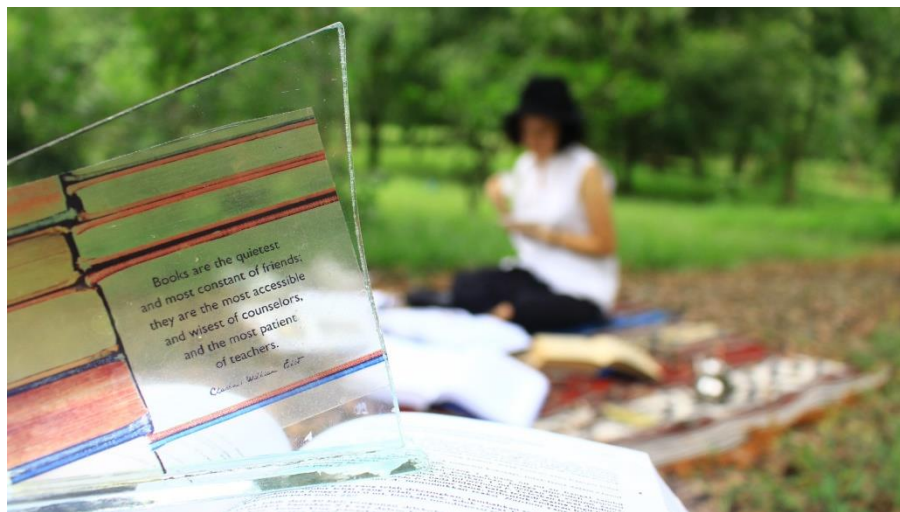
Figure 2. Visceral design of Herbochi.