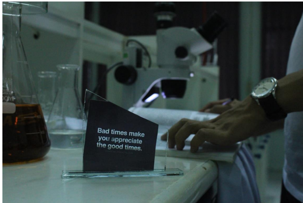
Figure 7. Herbochi with student who work hard all the time.