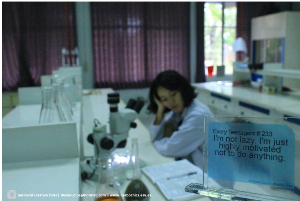
Figure 5. Herbochi with lower motivation student.