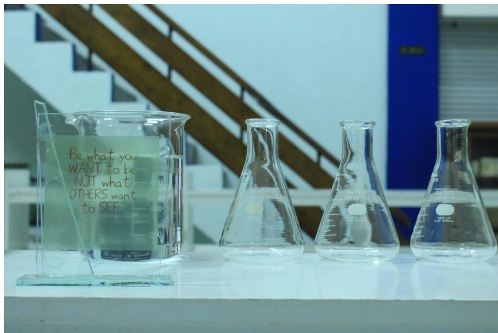
Figure 8. Herbochi lighten up the laboratory.