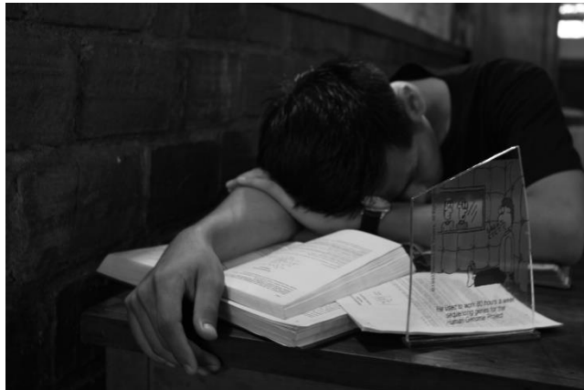
Figure 1. Herbochi with student work around the clock.