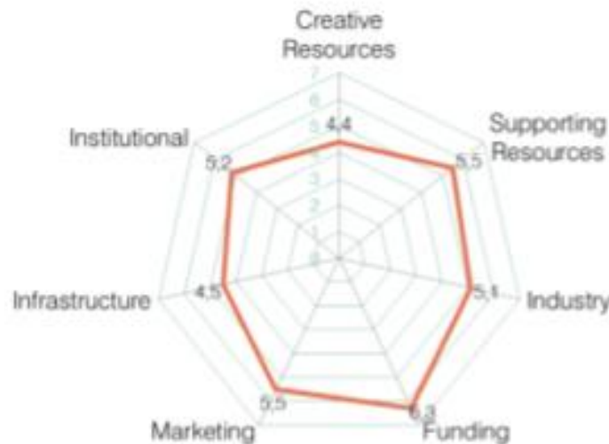
Figure 3. Mapping of competitiveness for Indonesian craft

Cokorda Istri Dewi (2014) from Ministry of Tourism and Creative Economy stated that the main problem of Indonesia’s craft industry is the lack of creative resources (creative people involved in this industry). It has the smallest figure (scale 1 to 10) among other seven indicators. Empowering craft-design makers is one way to reinforce this indicator.