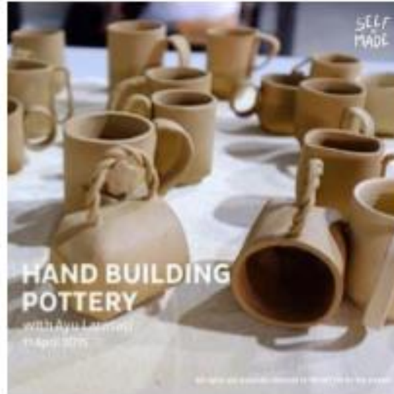
Figure 4. Hand building pottery workshop by Ayu Larasati at Indoestri Makerspace

Skill-sharing is another engagement for the Makers' brands. Some makers obtain additional income from workshop teaching or open studio. The cost may vary and depends on the organizer, some may be free, but it is mostly a simple, event-based, or a lecture only (without practice) workshop. To illustrate Ayu Larasati hosts a hand building pottery workshop which costs Rp. 1 million at Indoestri Makerspace but she also has a short lecture class with Lingkar.co which is free. After all it is a way for them to connect with other makers and craft enthusiasts. Other prominent workshop organizers are Living Loving Class, Mau Belajar Apa, and Tobucil.