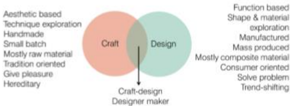
Figure 2. Characteristics of Craft and Design

Craft-design combines characteristics of both craft and design in a single product. For example a craft-design product may be produced by hand in limited edition (craft characteristics) but use composite material and functional (design characteristics). To some extent the highest distinction is that craft or craft-art represents hereditary cultural tradition while craft-design adapts the newest trend.