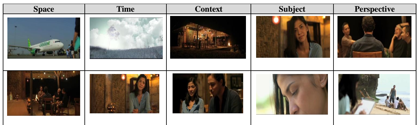
Table 2. Framing Adaptation Analysis

In this framing analysis, there are some changes in several elements such as; space, time, context, subject, and perspectives. This analysis investigates the correlation between each element in developing a theme and the meaning in the text of Rectoverso movie. There is the analysis result of the elements of space, time, context, subject and perspective.