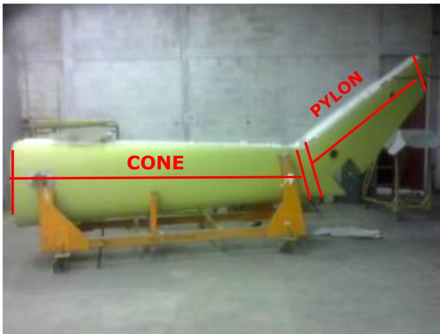
Figure I-1 Component of Tailboom Helicopter

Currently PT Indonesian Aerospace is conducting a tail boom project for MK-II to meet subcontract demand from France. Tail boom is the back side or the tail part of the airplane. It divided into two main parts there are Cone and Pylon as shown in Figure I-1.