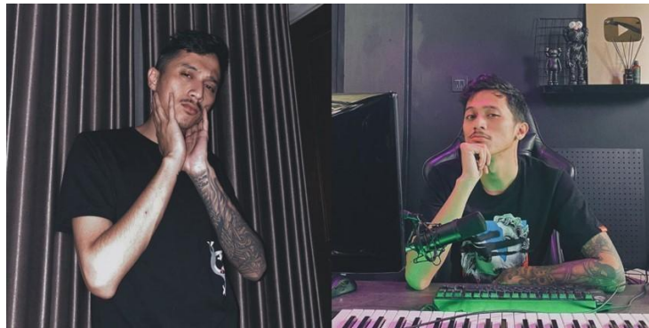
Picture 1. 1 Owner from Picky Picks YouTube Channel